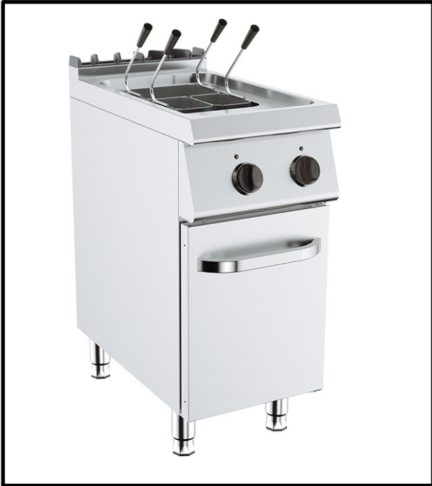
pasta cooker gas 8 kW