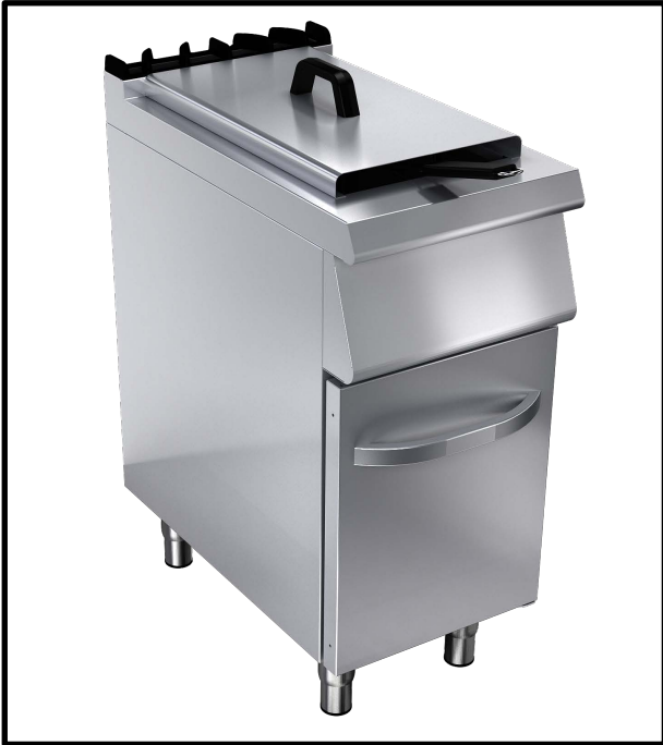
fryer 15 kW