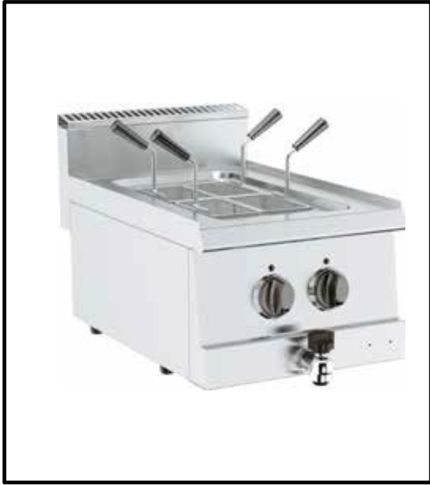
pasta cooker 6 kW