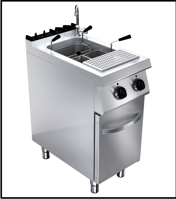
Pasta Cooker 12 kW G9M100E