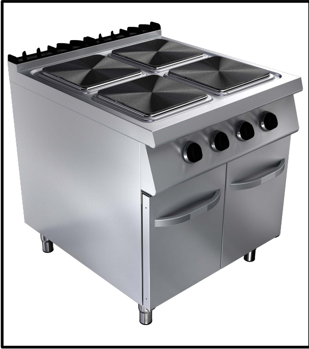
Electrical Cooker 12 kW