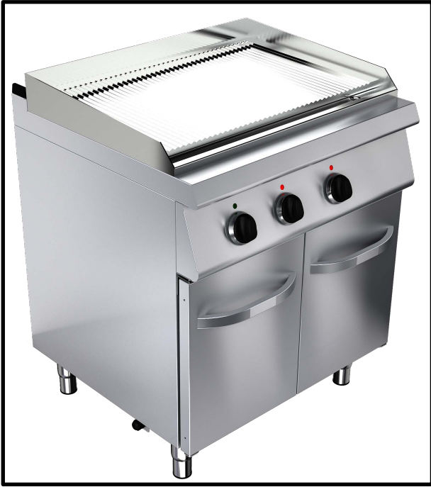
fry top fully ribbed 12 kW