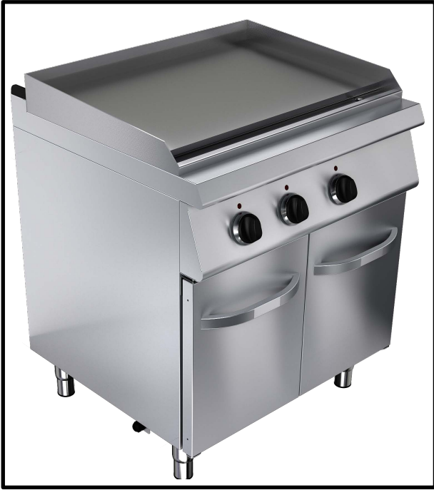
fry top smooth 12 kW