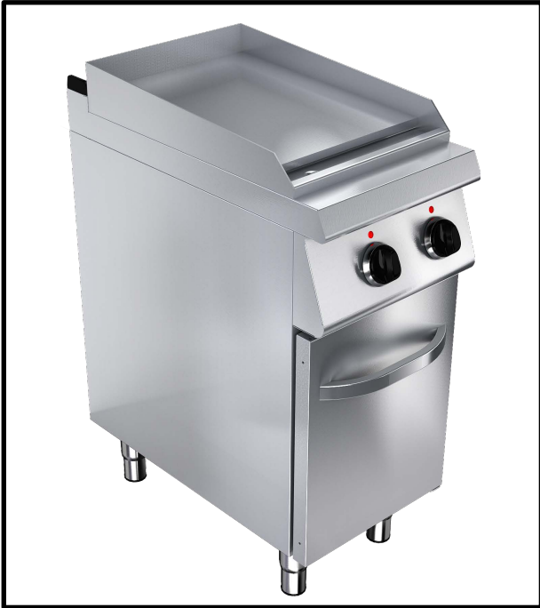
fry top smooth 6 kW