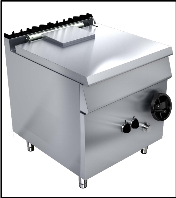
tilting bratt pan 9 kW