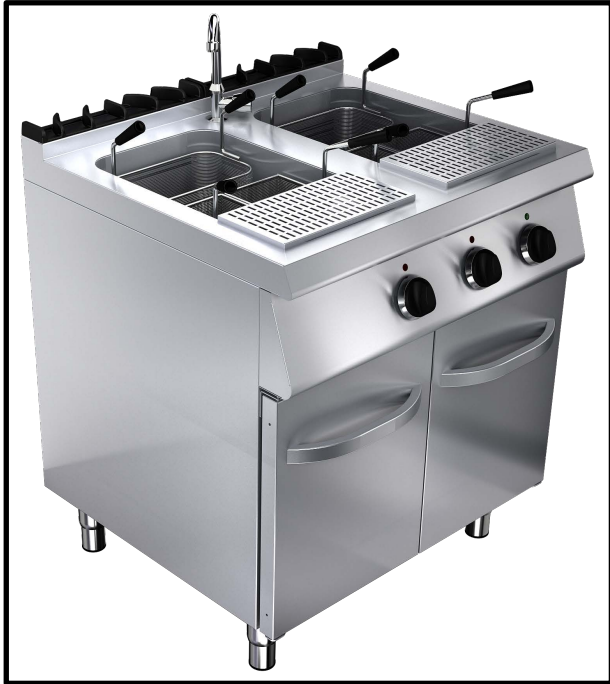
pasta cooker 20 kW