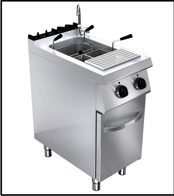
pasta cooker 10 kW