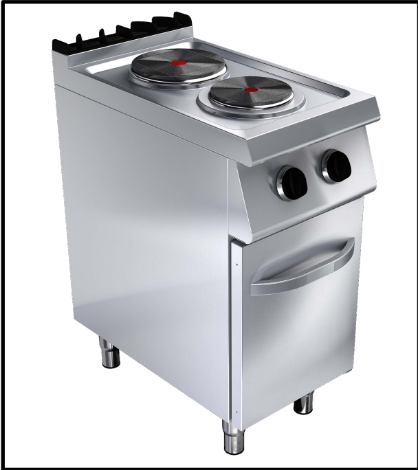
Electrical Cooker 3,5 kW