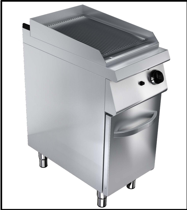
fry top fully ribbed 6,5kW