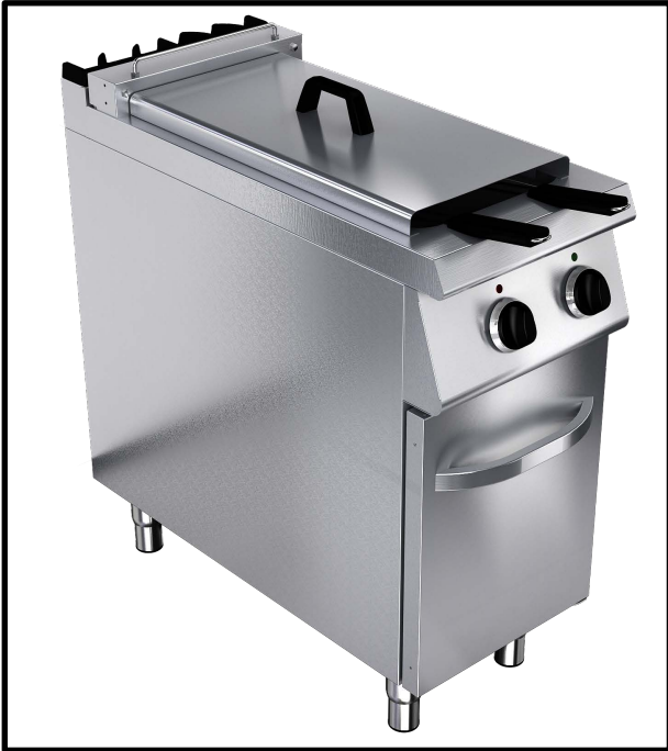
fryer 15 kW