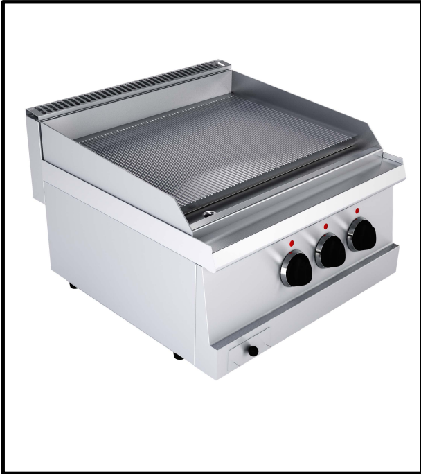
fry top fully ribbed 6 kW