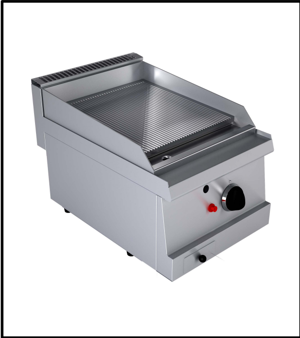
fry top fully ribbed 6 kW