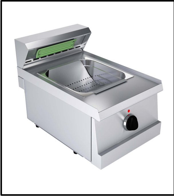
french fry warmer 0,85kw