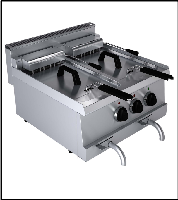
fryer 15 kW