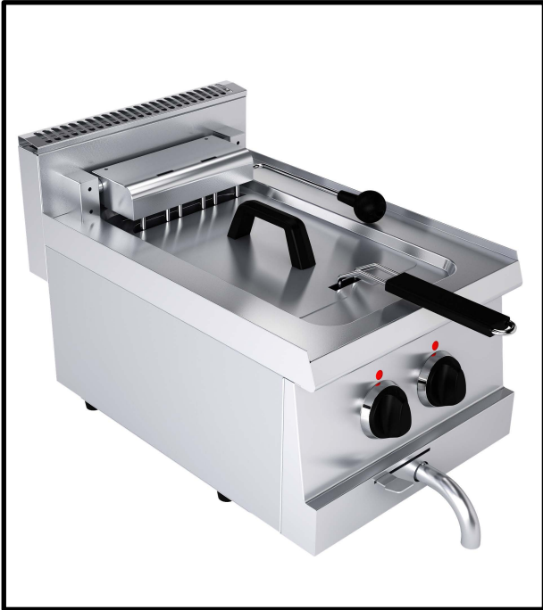
fryer 7,5 kW G6F100E